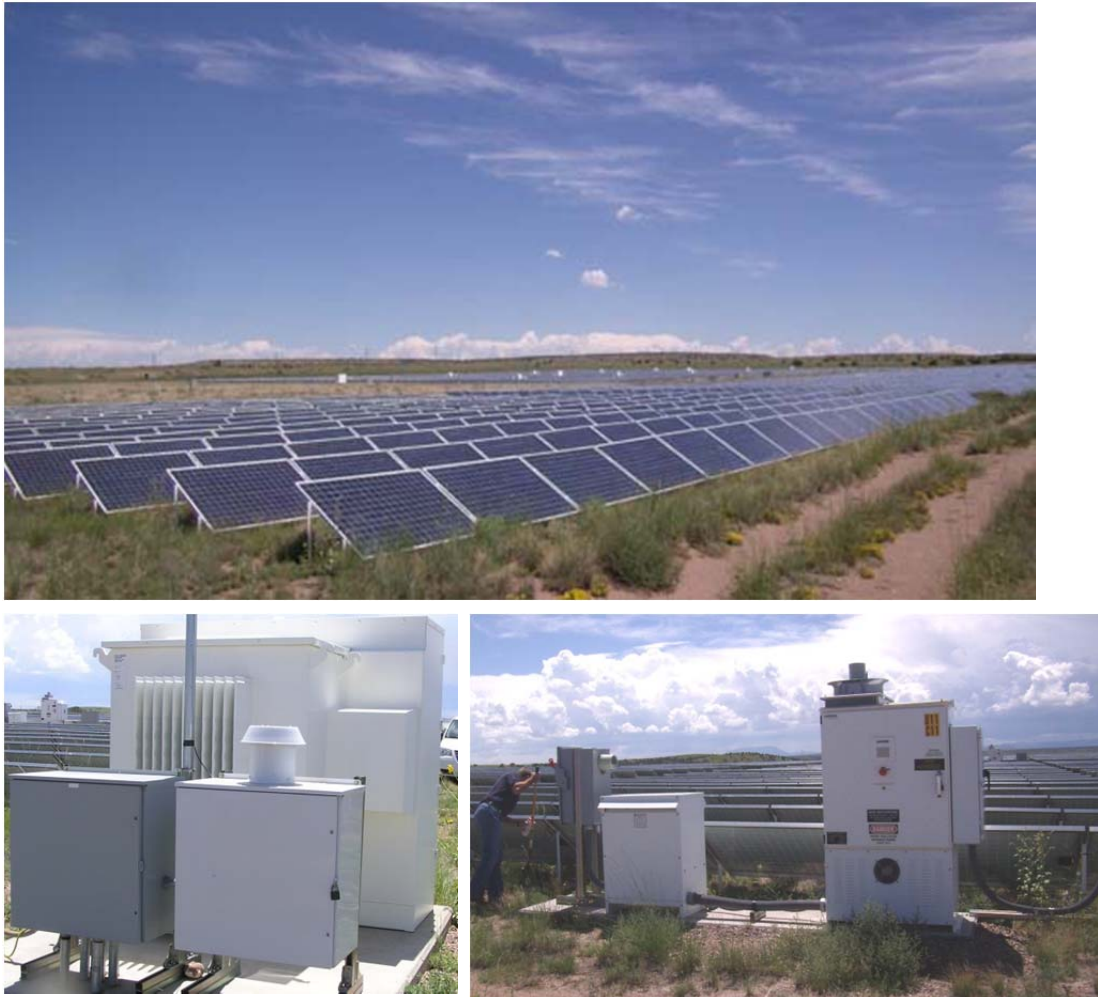
Figure 8. (Top) A portion of a 6.4-MW utility-scale solar field with panels arranged in rows. (Lower right) From right to left: One of the field’s 48 Inverters with attached dc disconnect connected to an intermediate step-up transformer and ac disconnect/meter. (Lower right) One of 12 large step-up transformers for transmission to the grid. Cabinets in foreground house instrumentation.

A typical utility-scale solar facility comprises acres of panels arranged in rows. DC power is collected from groups of rows and sent to large inverters via a dc disconnect switch. From the inverters, ac current passes to an intermediate-voltage 208 delta-480/277 wye step-up transformer. Groups of such transformers send power to larger 480-step-up transformers for transmission to the grid, Figure 8 . The solar field shown in the figure required 123,650 pounds of copper power cable, grounding cable and magnet wire.