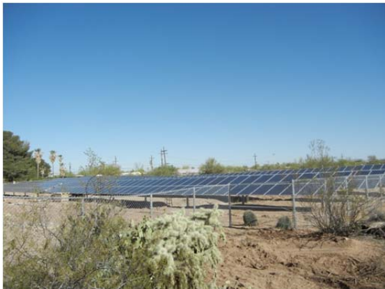
Figure 9. A 140-kW commercial-scale PV farm under construction. It will supply power to a water-utility office and garage. Installations of this type are one example of distributed generation.

Residential system designs are analogous to utility-scale fields, with panels connected to one or more inverters through a dc disconnect. Inverters typically incorporate a small transformer, from which ac power is sent to the service entrance and a two-way meter, from which it is fed to the residence or the grid as determined by need. Copper intensity in residential systems is readily scalable, since most copper is used to string together the required number of panels, and, in best-practice designs, to ground them. Distances to inverter/transformers, switchgear and the service entrance do not vary much. Hence a four-kW system will contain approximately twice the copper as a two-kW installation.