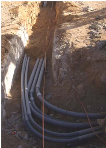
Figure 4. Copper-concentric-neutral power cables and bare-copper grounding conductors connect turbine towers.

Individual turbines in a farm are typically arranged in groups of various sizes. The groups are connected electrically via buried copper-concentric-neutral (aluminum conductor) power collector cables. Power from several groups may then be collected at one or more substations, from which power transitions to overhead aluminum conductors before (in some cases) being stepped up again to grid voltage.