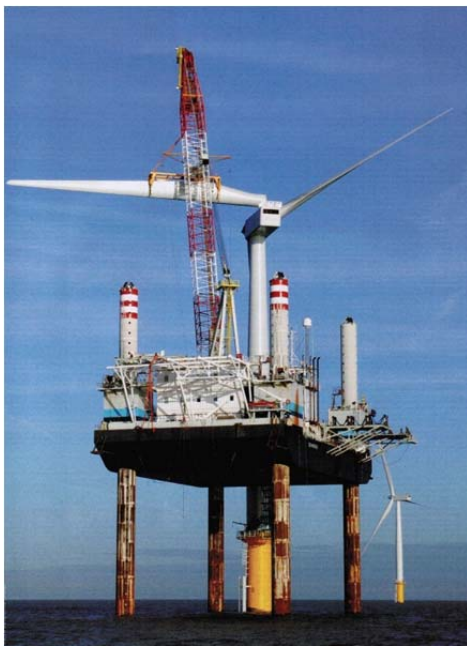
Figure 7. A large mast-mounted turbine being installed in the Irish Sea.

No firm specifications or designs have yet been published for potential U.S. offshore sites. Massachusetts's Cape Wind project has been issued a Federal permit and is now in early development stages, but Maine, Rhode Island, New York, New Jersey, Delaware, Maryland, Virginia, Pennsylvania, North and South Carolina, Georgia, California, Texas and Ohio (Cuyahoga County, on Lake Erie) are also planning offshore wind development with varying degrees of vigor. Actual turbine emplacement at Cape Wind will probably not begin for several years, and earlier construction may actually occur elsewhere, since at least three states; Maine, New Jersey, and Ohio, have declared their intent to pursue fast-track development, possibly without Federal involvement.