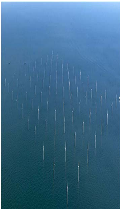
Figure 6. The Danish Horns Rev wind farm in the North Sea.

The United Kingdom, Denmark, Germany and Norway are the current leaders in offshore wind energy development. Denmark, an early adopter, derives some 40% of its electricity needs from the North Sea, Figure 6 . The UK's 47-GW target leads the world in offshore activity. Already, 980 MW of capacity has been installed, more than 1 GW is under construction and there are 32 GW in proposals currently circulating, Figure 7 [Lyons 2011].