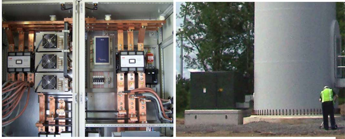
Figure 3. Switchgear, left, and a 2-MVA step-up transformer at the base of turbine mast, right.

Several manufacturers now offer turbines featuring a direct-drive connection between turbine and generator, eliminating the repair-prone gearbox. One supplier now offers turbines with variable speed, permanent-magnet-excited, dc generators coupled to high-frequency inverters, power-conditioning equipment and aluminum-wound transformers from which high-voltage ac power is transmitted to the base of the tower.