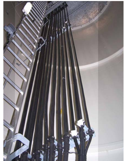
Figure 2. Heavy DLO cables inside the turbine mast transmit low-voltage generator power to switchgear and a step-up transformer.

Fifteen or eighteen phase, plus one neutral, heavy-gage copper DLO cables transmit 600-V generator power to switchgear and a copper-wound step-up transformer located at the base of the tower Figures 2-3 . These cables have constituted a significant contribution to copper intensity. Many manufacturers adhere to this design. However, at least one supplier mounts an aluminum-wound, cast-coil step-up transformer in the nacelle, enabling the transmission of high-voltage power, usually at 34.5 kV, to the base of the tower via lighter-gage conductors. Copper intensity is thereby reduced.