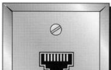
Figure 3 (below) shows a wall outlet with two such jacks.

These devices provide connection points for all eight of the wires contained in the four twisted pairs.