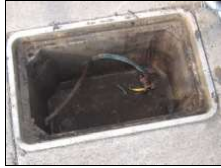
Fig. 5. In this instance, copper oxide runoff during rain events is of no consequence. The copper oxide that will develop serves to protect the underlying copper.

When the chemical composition of the soil is unknown (in the absence of soil testing), it is the user's choice to stipulate tinning or bare. In most cases, bare copper is sufficient, although we recommend exceeding the rather minimal gauge requirements of the NEC. 4/0 AWG or larger is commonly found in industrial environments.