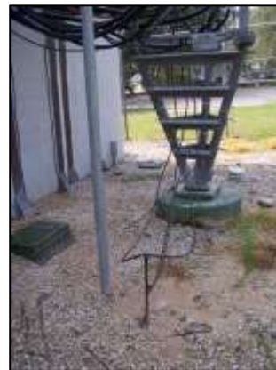
Fig. 2. Above-ground use of 4/0 AWG bare copper grounding conductors for coax braids at a communications facility. In this case, runoff considerations and corrosion were not issues and bare copper is perfectly suitable. Note the rich, brown color of the copper down-straps at left after approximately 10 years in service.

The designer of a grounding system typically performs a soils analysis before designing the grounding system. Soil aggressiveness and chemical composition will determine the appropriate steps to take.