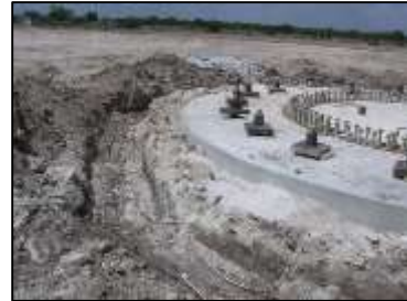
Fig. 1. Bare 4/0 AWG parallel copper conductors are prepared for direct burial to form two ring grounds around this wind-powered generator base. Soil analysis indicated that bare copper was entirely appropriate at this site for direct burial with no corrosion concerns.

Copper and copper alloys are widely used because they combine unique properties at an economical price. These include high thermal and electrical conductivity, ease of manufacture, high recyclability and good corrosion resistance. Copper, a noble metal that occurs naturally in its elemental form, is almost totally impervious to corrosion from soils found worldwide. But it would be misleading to infer that copper will not corrode.