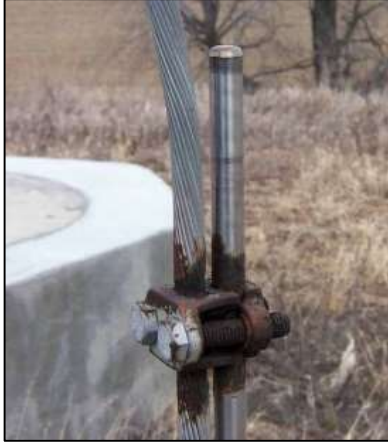
Fig. 3. Copper and galvanized steel are more susceptible to corrosion where the pH of the soil exceeds 8. Soil analysis at this site (a dairy pasture) indicated a large concentration of organic acids. Stainless steel ground rods were indicated, along with tinned 250 kcmil copper conductors. They were connected with a bronze fitting listed for that purpose, and coated with zinc-rich protective paint.