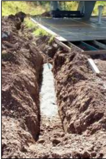
Fig. 6. A chemical-filled electrode surrounded by bentonite backfill (the white slurry) to improve electrical connectivity to the earth.