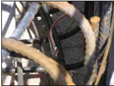
Fig. 4. Bare copper can be directly attached to rebar for concrete encasement. Note that exothermic welding was utilized for this purpose. The concrete that will surround the rebar will act as a buffer, helping to prevent galvanic action from the soil. (“Steel rebar embedded in concrete has approximately the same potential as copper, thus will not corrode” – IEEE Std. 142-1991)