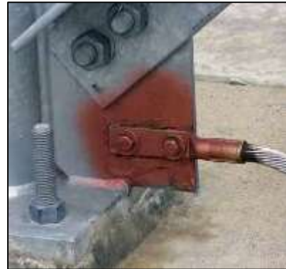
Fig. 7. Tinned 4/0 copper conductor attached to a galvanized steel flange of a support column. Note the high pressure compression fitting and protective paint.

Outdoor air can act as an electrolyte because it contains a variety of components which can cause corrosion of any metal. Varying moisture levels, salt and other contaminants are just a few. In overhead, outdoor construction, copper runoff can cause staining of pavement materials. It's one reason why older overhead telephone wiring (before plastic coverings) was usually tinned. In addition, copper runoff can be very corrosive to galvanized steel support structures, even when not in direct contact. In such cases, tinning of the conductors is recommended to prevent such conditions.