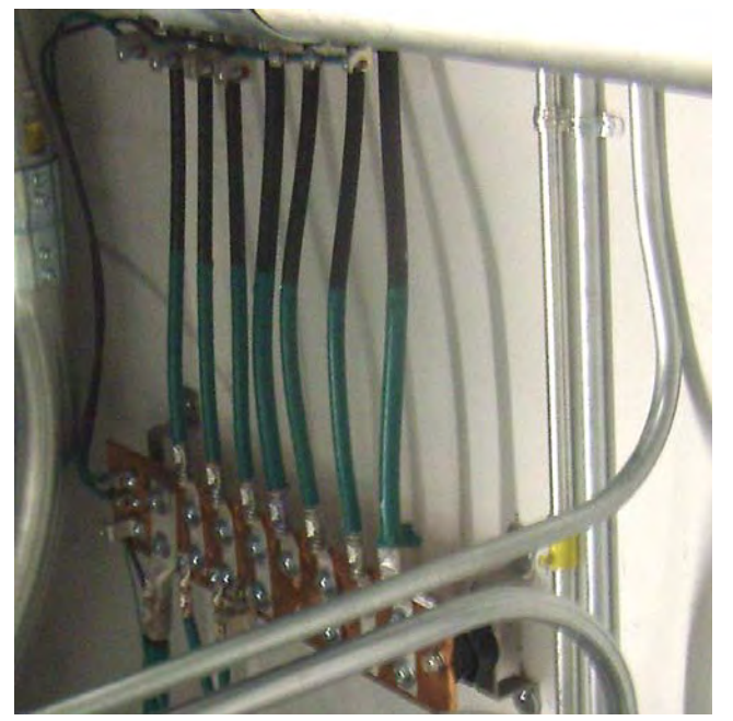
Figure 9. A 1,000 kcmil grounding conductor (lower left) from the main grounding bar terminates at a ground bar serving one floor from one of the building's two ground risers. Smaller conductors bonded to the main floor bar (upper cables) lead to collector bars on the floor.