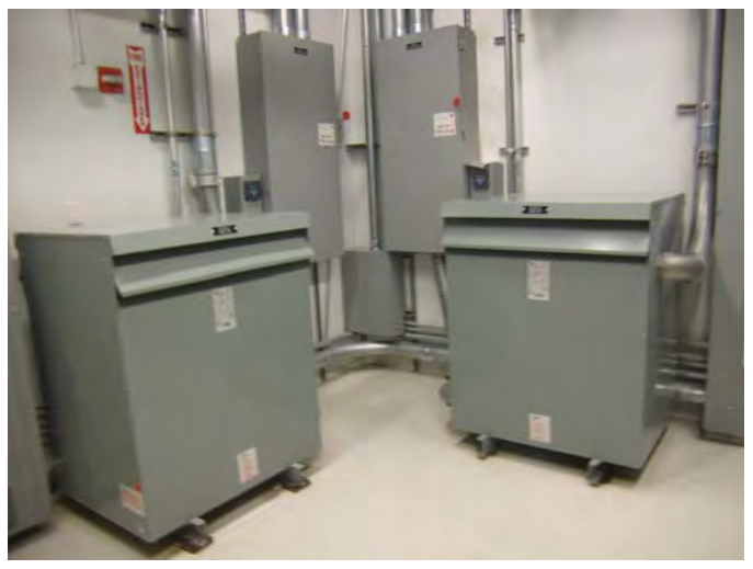
Figure 5. Two (of more than 100) redundant 480 V-208/120 V distribution transformers feed customers' servers and convenience outlets. All sub-distribution transformers are copperwound, dry-type, K-rated, and meet NEMA TP-1 efficiency standards.

Approximately one hundred 480 V-208/120 V distribution transformers of various sizes feed servers and convenience outlets ( Figure 5 ). Additional 480/277 V transformers serve lighting and HVAC requirements. All distribution transformers are copper-wound, dry-type, K-rated (mostly K13 and K20) units meeting NEMA TP-1 efficiency standards.