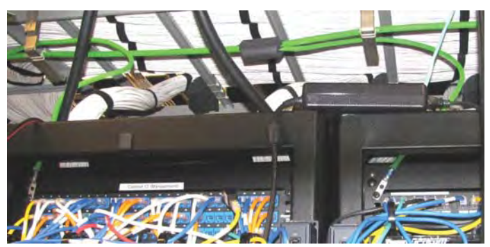
Figure 11. Green grounding conductors bond individual cabinets to an overhead collector bus. In this example, cabinet grounds are AWG #6 and the collector bus is #2, but larger sizes may be used.

proximately every 3000 sq ft of raised-floor area, one 4/0 grounding conductor is run from the grid to the wall-mounted collector bar.