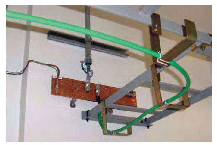
Figure 10. Multiple grounding collector bars are mounted on walls in server rooms. The AWG 2/0 conductor, top, leads to the riser bar, while #2 green cable, bottom, is a collector bus for a row of cabinets. Conductor sizes vary with clients' needs.

The raised-floor grounding system consists of grids of AWG #2 and 4/0 bare copper, ( Figure 13 ). For ap-