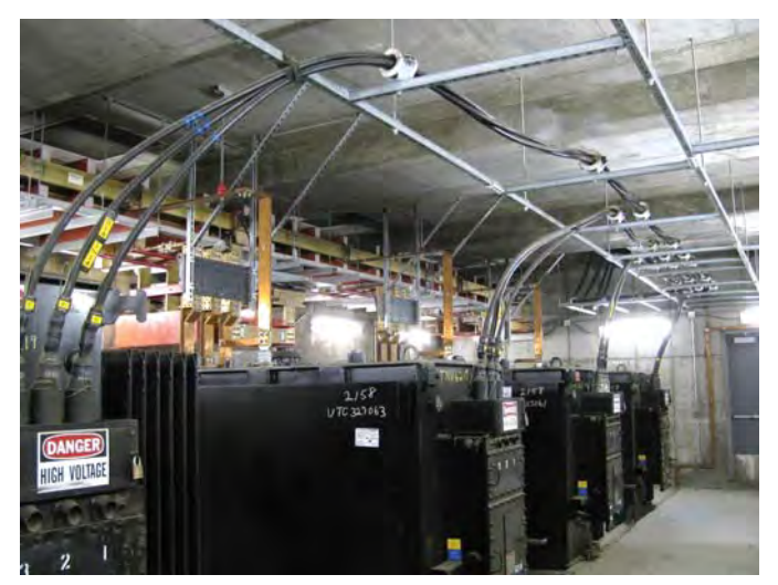
Figure 3. Four of eight 13.8 kV-480 V utility transformers located in a vault at One Summer Street. A similar set of transformers in a separate vault form the other half of the double-ended utility feed. Copper buswork seen at the upper left feeds distribution switchgear located in the basement. Utility ground straps are visible on the floor and rear wall.

The building's utility vaults are designed for a 20-MW electrical service, which is expandable to 40 MW. The vaults are dedicated to the data center. Two entirely separate 13.8-kV, 10-MW utility feeds enter through the two vaults, each containing four liquid-cooled, 2,500-kVA, 13.8 kV-480/277 V transformers, Figure 3 . Three double-ended switchboards provide fully redundant