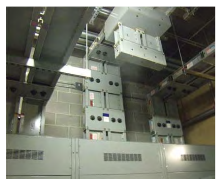
Figure 4. Switchgear (in cabinets, bottom) and three of the ten 480-V, 4,000-A copper bus risers that feed power to upper floors (top of photo). Four 5,000-A bypasses enable switching among primary feeds.

The center's 480-V power is distributed from the basement to server floors via ten 4,000-A copper bus risers. Four 5,000-A bypasses connected to the 6000-A rated switchgear enable load-switching among the riser feeds in the event one service should fail ( Figure 4 ). Power bus risers are physically separate from IT/data risers in order to avoid electrical noise on sensitive circuits.