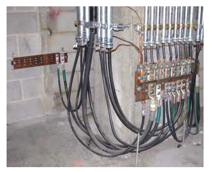
Figure 7. The main grounding bar at One Summer Street is a three-foot by one-foot copper plate (right) located in the subbasement. All grounding conductors in the building's two grounding system branches terminate here. The smaller bar at left rear is an extension of the larger bar.

The single point Mr. McLean refers to is the center's main grounding bar, a one-foot-high by three-feet-wide copper plate located in the building's subbasement ( Figure 7 ). To that plate alone are bonded all ground leads from the building. There are actually two risers for the grounding system: one for the power distribution system, which includes generators, transformers and UPS equipment; the other for IT and communications circuits. Separating the two systems isolates IT/comm equipment from noise, harmonics and floating ground currents that may be present at ground-to-neutral bonds. The two systems are bonded together only at the main grounding bar.