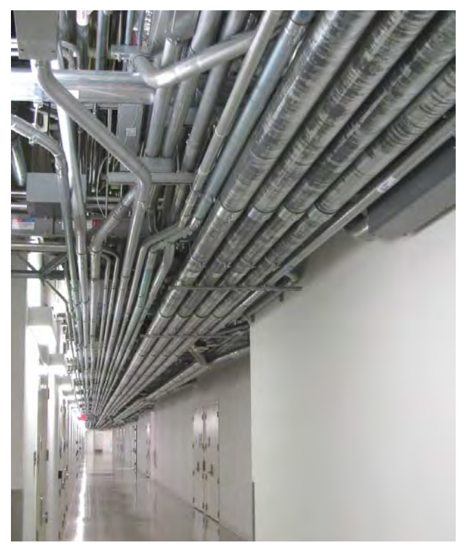
Figure 8. Typical conduit runs at One Summer Street illustrate why the center relies on separate internal green wires rather than conduit itself as the grounding path. Copper is a better conductor than conduit steel. And, if conduits were used for grounding, thousands of connections and fittings would have to be inspected, torqued and tightened periodically, a hopeless task.

Grounding connections between the main grounding bar and the two grounding system branches are made through separate risers in the building's corners, one for power distribution and one for IT equipment. Plans called for adding two more ground risers in the near future. Conductors from the main bar to the building floors are sized at 750 and 1,000 kcmil. They terminate at one-foot by three-foot copper grounding bars at each floor ( Figure 9 ). Smaller conductors lead from those bars to multiple four-inch by one-foot collector bars located high on walls throughout the floor space