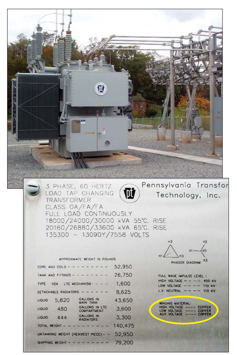
Figure 2. One of two substation transformers recently installed by Allegheny Power (top). Note the compact pad for this 33.6-MVA unit. The portion of the dataplate shown at the right identifies the winding material as 100% copper. According to Allegheny Power's Joe Leighty, the choice of copper is a "no-brainer" in this transformer size range.

13.2/7.6 kV units at a substation that will serve a new shopping mall north of Pittsburgh. The transformers are equipped with vacuum-driven tap changing to adjust for our variable load. Like all transformers we buy today, these are completely copper-wound ( Figure 2 ).