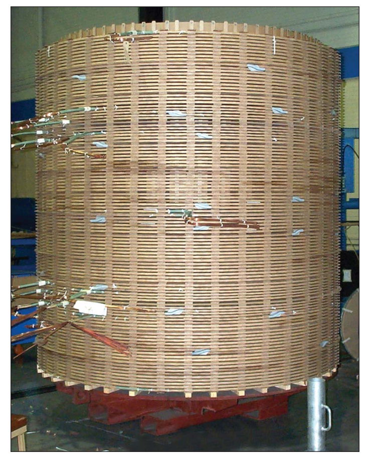
Figure 3. Finished coil for a large substation transformer showing paper insulation before oil impregnation. Thermal cycling can compress the insulation, a condition that can eventually lead to loose connections. Copper-wound transformers are much less prone to this effect than those wound in aluminum, one reason copper transformers are known for high reliability.

"Later, when the temperature returns to normal, the insulation in an aluminum transformer might not be as tight as it was before the overload. That allows the windings to loosen slightly, a condition that might lead to loose connections at some point in time."