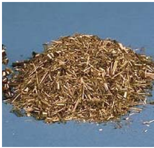
Type I alloy (C36000) produces small, fragmented chips.