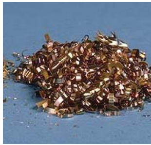
Type II alloy (C64200) produces curly, often brittle chips.