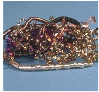
Type III alloy (C18200) produces long, stringy chips.