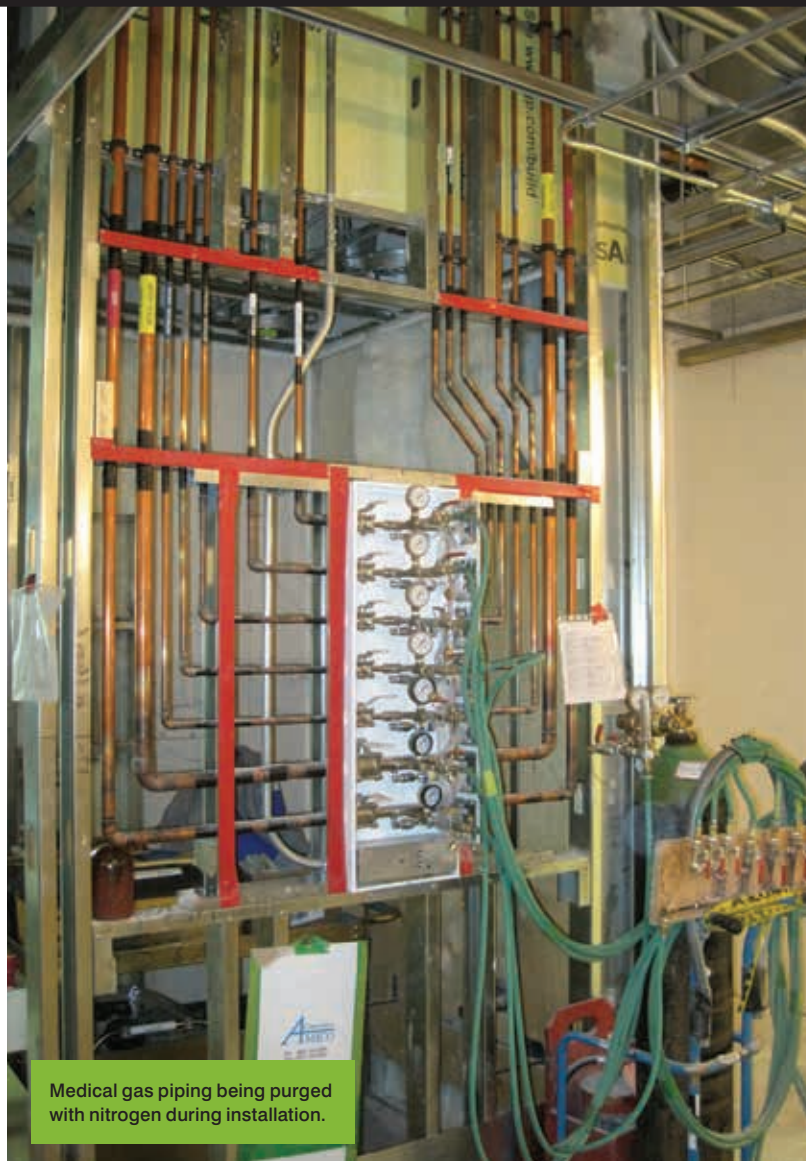
Medical gas piping being purged with nitrogen during installation.

Knowing that appropriate steps are being taken to maintain the internal cleanliness of system components will help ensure clean, safe and odor-free medical gas distribution in all healthcare facilities.