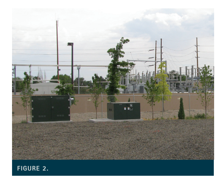
The Boise center is supplied with two 2.5-MW/12.7-kV feeds. Power is fed to the center via two independent, redundant feeds labeled "Blue" and "Red".