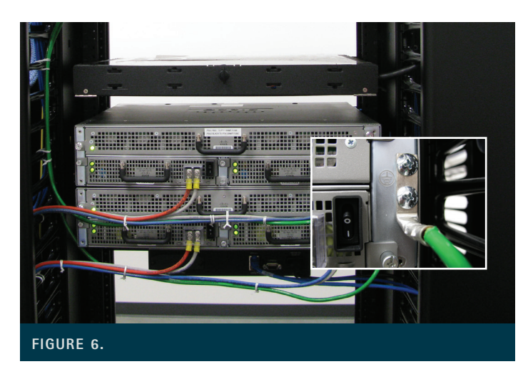
Equipment mounted in racks. Green wires are routed to the left of the figure and up to the Starline buses. Insert shows green wire with double-screw attachment lug.