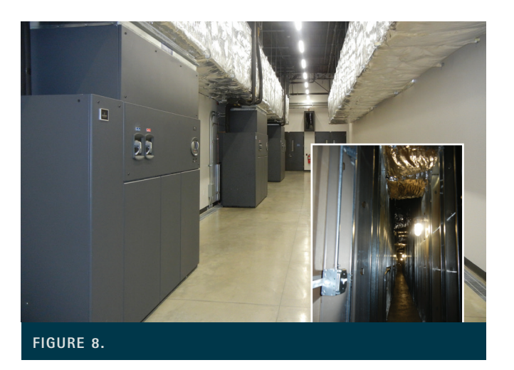
Three of four 25-ton Liebert units supplying cold air for the center. Air is then mixed in a mixing chamber (insert) located behind the units (insert).