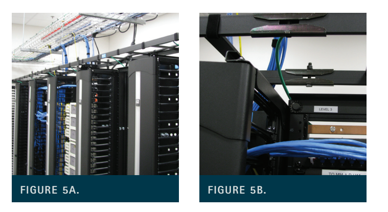
Equipment racks in the relatively small (compared with data rooms) carrier rooms are also connected via busway (Figure 5a). Grounding connections are made to a copper grounding bus located above the stack of cabinets in the racks (Figure 5b).