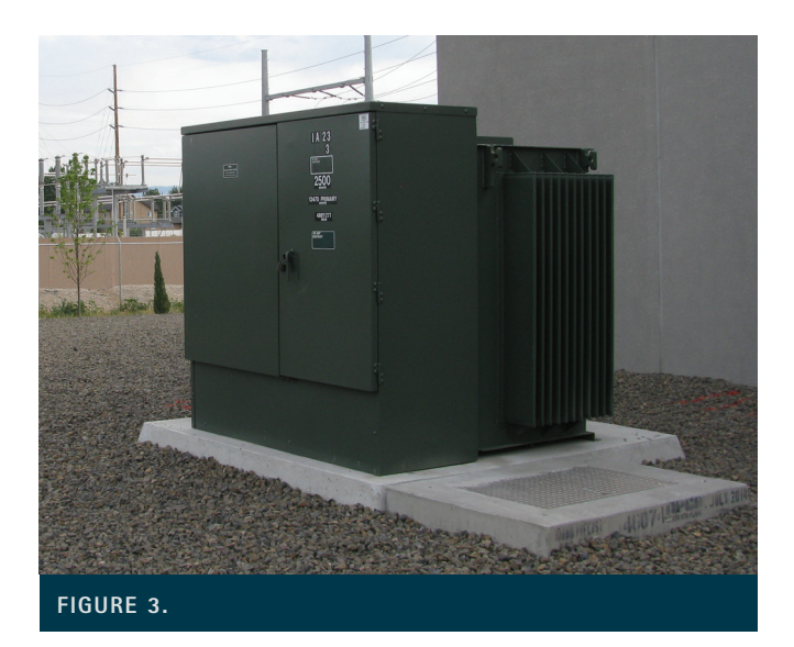
One of two 2500-kW, 13.5-kV/480-V utility transformers serving distribution switchgear in one of the Boise center's data rooms.

"Customers provide their own dual power distribution units to support their IT equipment," Hinkle said. "We use Starline™ busways (Figure 4) which enable technicians to add or change